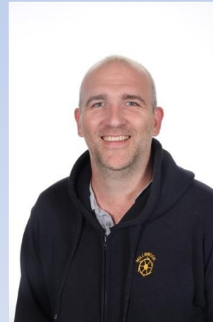
Mr Wood Tokyo Class